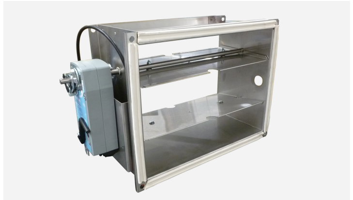
Figure 2 Example of Automated Exhaust Damper

Manufacturers of ABD systems attempt to develop algorithms to account for these variables, however like all complex products, it is inevitable that failures will occur in the design, installation, commissioning, and maintenance process. Test and Balance technicians are